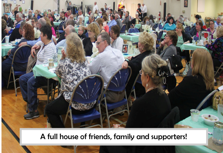
A full house of friends, family and supporters!

A sold out crowd filled our gymnasium for food, fellowship and spirited bidding. Thank you for your support!