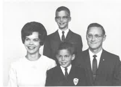
Forest Sabin Family