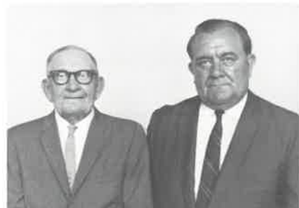
August Lenz & Son