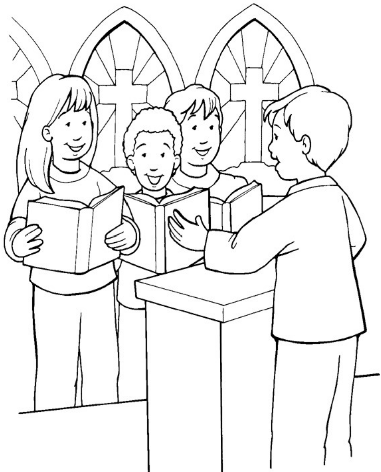
Let's praise Jesus!